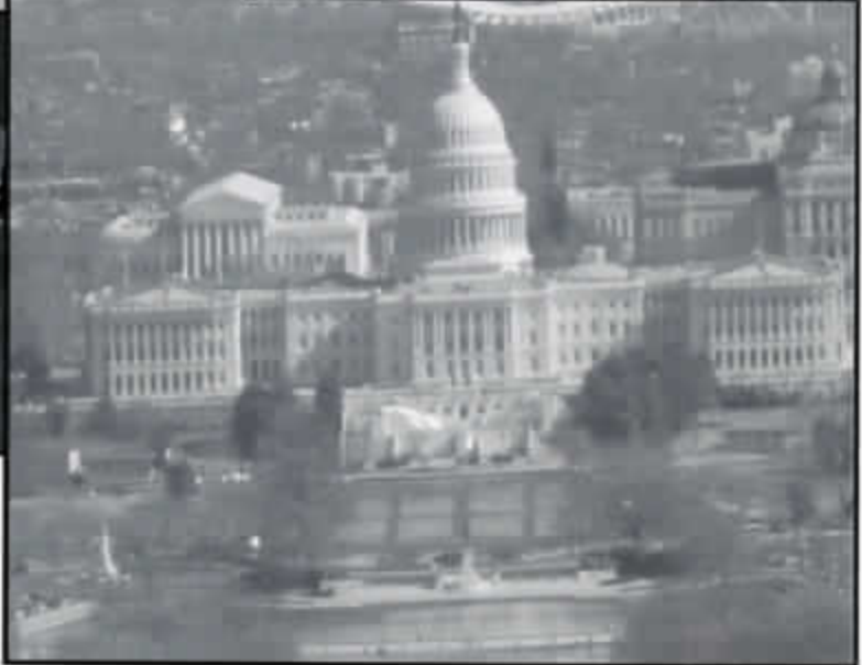
SIGHTS OF WASHINGTON D.C. Pictured clockwise are The White House; Mary Todd Lincoln's gown and presidential china featured in the Smithsonian's National Museum of American History; the Capital Building, the Hope Diamond featured in the Smithsonian's Natural History Museum; and Vietnam War exhibit featuring an authentic helicopter at the Smithsonian's National Museum of American History.